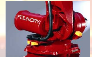
FOUNDRY COUNTER-BALANCING SYSTEM