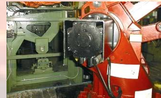
ENGINE HARD PROTECTION