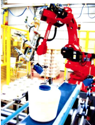
PICKING AND PLACING