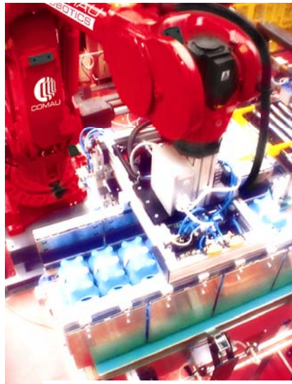
PALLETIZING & DEPALLETIZING